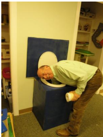
Trunk or Treat October 31, 2011