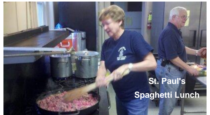
St. Paul's Spaghetti Lunch