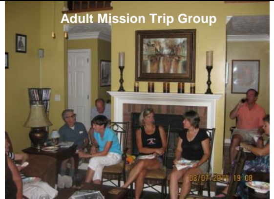
Adult Mission Trip Group